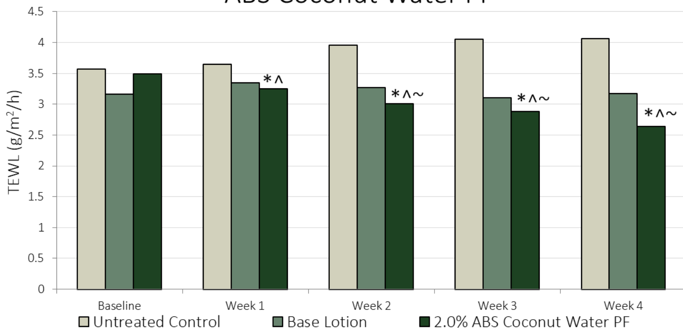
Figure 1. TEWL Measurements Overtime. * indicates significance ( p \leq 0.05 ) compared to Baseline values. ^ indicates significance ( p \leq 0.05 ) compared to Untreated Control within the same timepoint. ~ indicates significance ( p \leq 0.05 ) compared to Base Lotion within the same timepoint