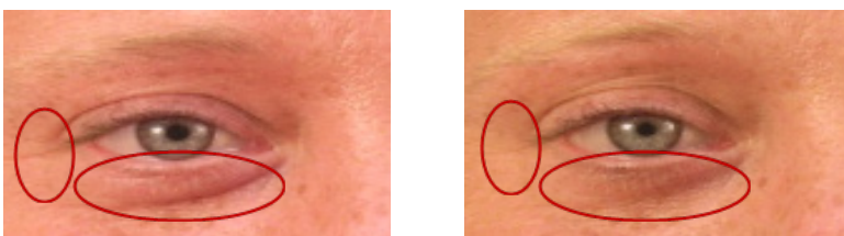
Figure 2. Before and after images of subject #2 following application of a Revital-Eyes solution.

Exhibited anti-aging by decreasing under eye bags & dark circles (tested at 5%)