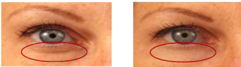
Figure 1. Before and after images of subject #1 following application of a Revital-Eyes solution.

An in vivo study was conducted over a period of three weeks to evaluate the effect of Revital-Eyes on under-eye bags and dark circles. 10 M/F subjects between the ages of 23-45 participated in the study. Following initial measurements, all subjects were asked to apply a 5% solution of Revital-Eyes to the right periorbital area twice a day for three weeks. Photographs were taken immediately after application of test materials and then weekly for three weeks. Results indicate that this material is capable of significantly decreasing the appearance of under-eye bags and dark circles. In addition, wrinkles and expression lines were also diminished with consistent product use.