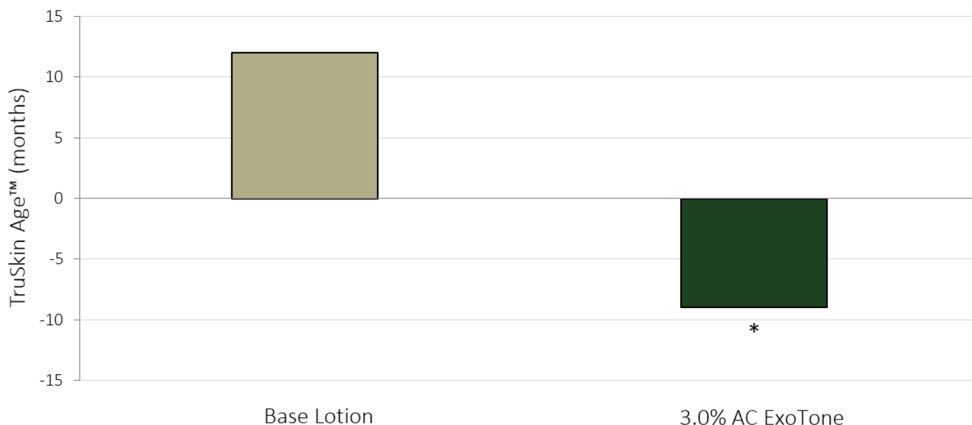
Figure 2. Change in VISIA TruSkin Age™ in Participants After Four Weeks of Application. * indicates significance ( p \leq 0.05 ) between conditions.