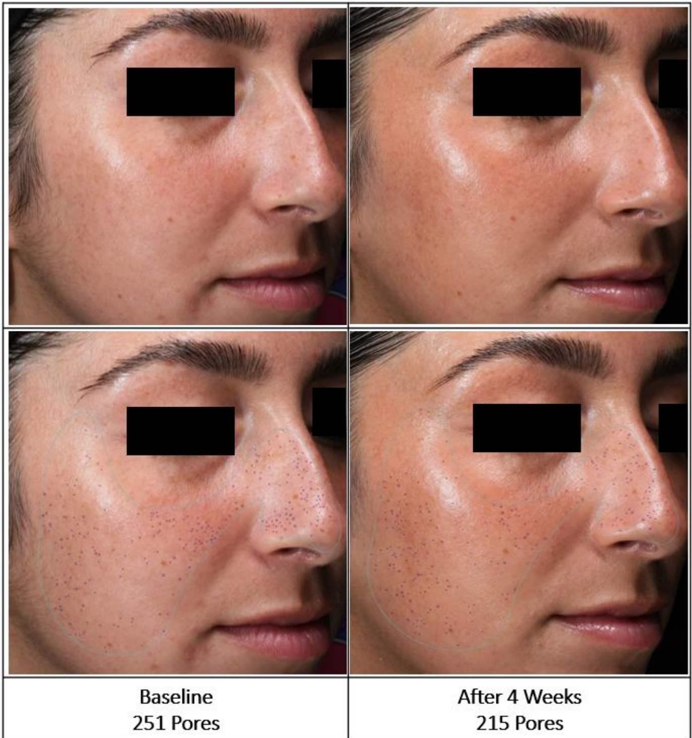
Image 1. Images of Participant Treated with 3.0% AC ExoTone. Natural photos (top) and VISIA Image Enhancement (bottom) Before and After Four weeks. Pores are circular surface openings of sweat gland ducts that appear darker than the surrounding skin tone due to shadowing and denoted by dark blue circles.