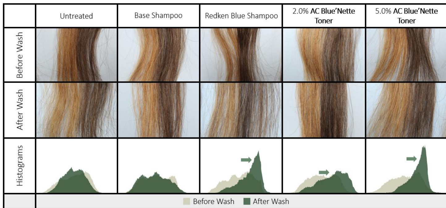
Figure 2. Representative images of partially bleached brunette hair tresses before and after washing with corresponding R+G+B histograms. The green arrows indicate a shift towards the blue end of threshold indicating a reduction in orange tones.