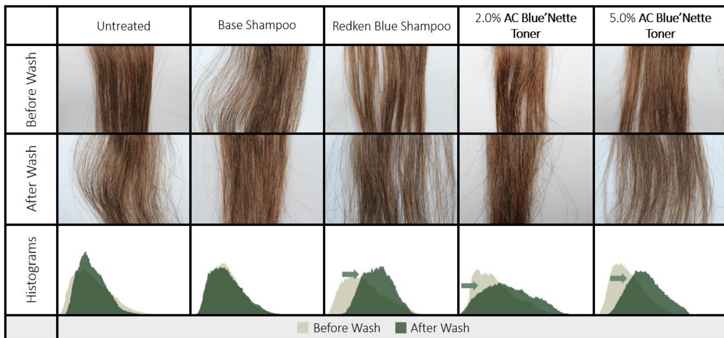
Figure 1. Representative images of virgin brunette hair tresses before and after washing with corresponding R+G+B histograms. The green arrows indicate a shift towards the blue end of threshold indicating a reduction in orange tones.