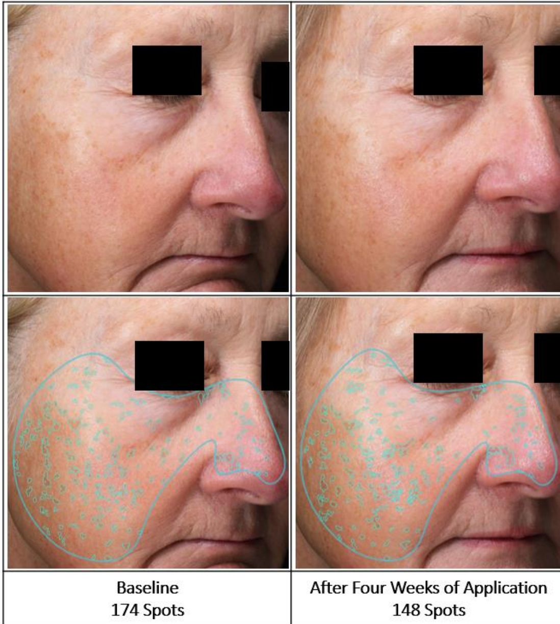
Image 2. Images of Participant Treated with 2.0% AC ExoEternal . Natural Photos (top) and VISIA Image Enhancement (bottom) Before and After Four weeks. Surface Spots are denoted by light blue shapes.