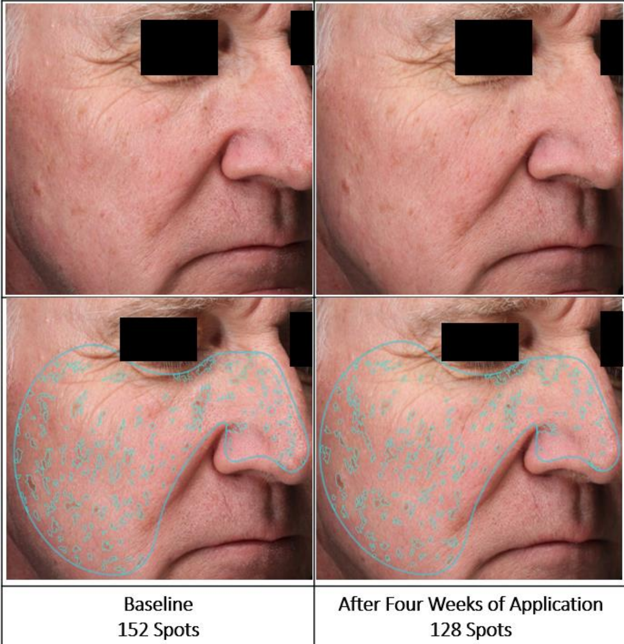
Image 1. Images of Participant Treated with 2.0% AC ExoEternal. Natural Photos (top) and VISIA Image Enhancement (bottom) Before and After Four weeks. Surface Spots are denoted by light blue shapes.